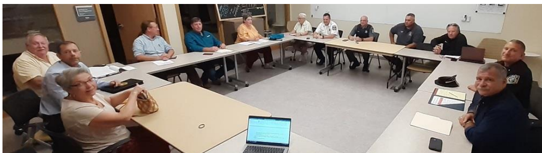
The Town/Gown Committee meeting, August 18, 2022